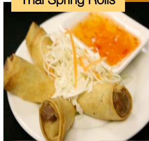
Thai Spring Rolls

Grilled tenderloin of chicken marinated in yellow curry and coconut milk served with peanut dipping sauce and cucumber salad.