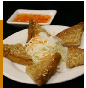
Cozy Thai Canapés